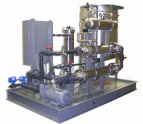
Plate & Frame and Presses