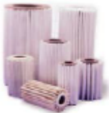
Radial Film Elements