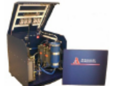
Electrostatic Precipitators for Varnish Removal