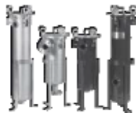
Bag & Ctg Filter Housings