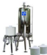
Lenticular Disc Housings