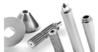
Sintered Metal Filters