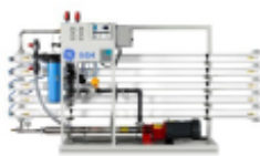
RO, UF, Nano