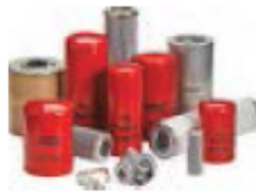
Fleet Service Filters