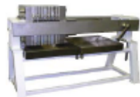
Plate & Frame Filter Presses