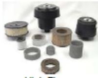
High Flow Breathers