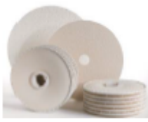
Die Cut Pads & Lenticular Disc