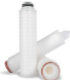
High Purity Cartridges