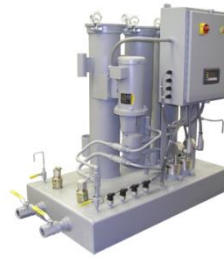
Varnish Mitigation Systems for Lube Oil