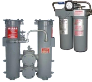
Lube Oil Duplex Filters & Transfer Valves