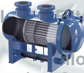
Wet Gas Coalescers