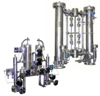
Seal & Fuel Gas Filters Gas Conditioning Skids