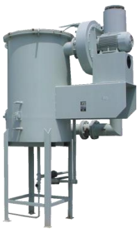
Oil Mist Eliminator For Crankcase & Gearbox