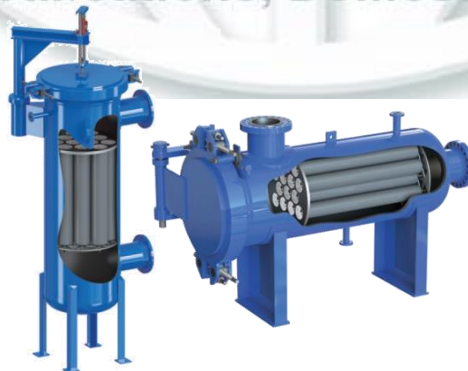
Liquid Process Filtration