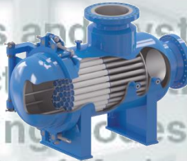
Wet & Dry Gas Filter Separators