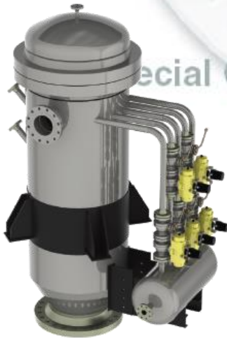
Self-Cleaning Metallic Filters for Extreme Duty Service

Special Certifications, Domestic Materials, etc.