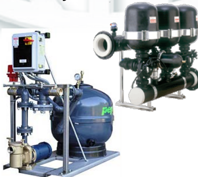
Automatic Backwash Water Systems