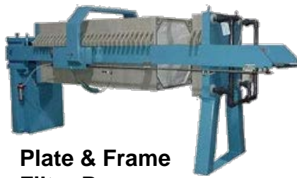
Plate & Frame Filter Presses