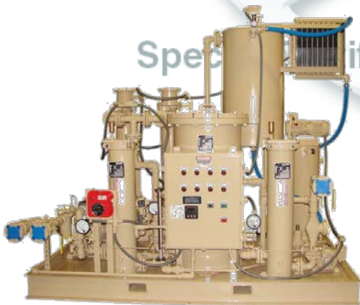
Vacuum Dehydration & Coalescing Separators

ASME (American Society of Mechanical Engineers) API (American Petroleum Institute) BS (British Standards) CSA B51 (CRN, Canada) DOSH (Malaysia) NR-13 (Brazil) Others: Special Applications, Domestic Materials, etc.