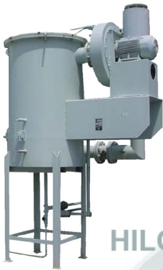
Oil Mist Eliminators