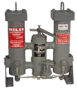
Simplex, Duplex & Multiplex Filters