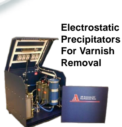
Electrostatic Precipitators For Varnish Removal