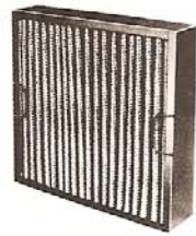
P-116 Filter Panel