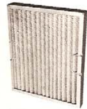
P-61 Filter Panel