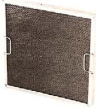
P-5 Filter Panel